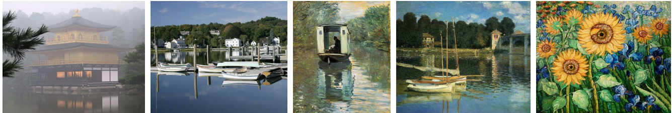
(a) Japanese Temple

1 University of Washington 2 Microsoft Research 3 National Taiwan University